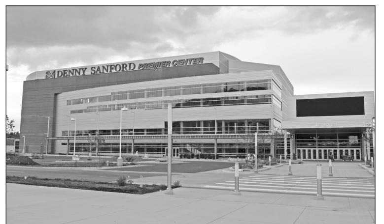
CHEYENNE CHONTOS / KNIGHT SCROLL

More information on the Center's events can be found at www.dennysanfordpremiercenter.com . The first Stampede hockey game will be on Oct. 11.